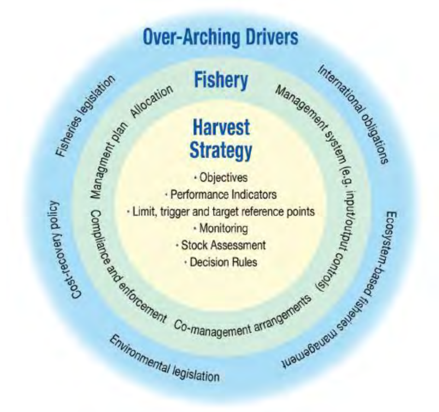
Figure 1: A schematic representation of how a harvest strategy fits within the overall fishery management framework (Sloan et al. 2014).

To ensure their effectiveness at achieving the wider policy objectives that relate to ESD, as well as optimal and equitable resource use, harvest strategies should integrate the full set of biological, customary, economic and social objectives relevant to a fishery, where they relate to operational harvest.