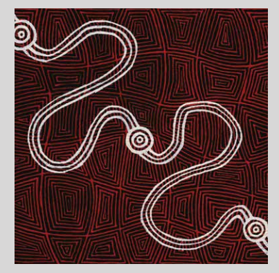
Title: The Journey