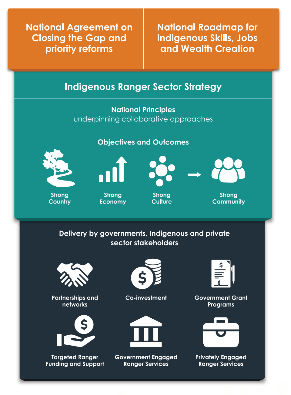
Figure 1: An integrated national approach to the Indigenous Ranger Sector Strategy

As described in Figure 1, this Strategy proposes an integrated, sector-wide approach. The NIAA will lead collaborative implementation of the Strategy by applying the National Principles and through consultative mechanisms with agencies and stakeholders at jurisdictional and regional levels.