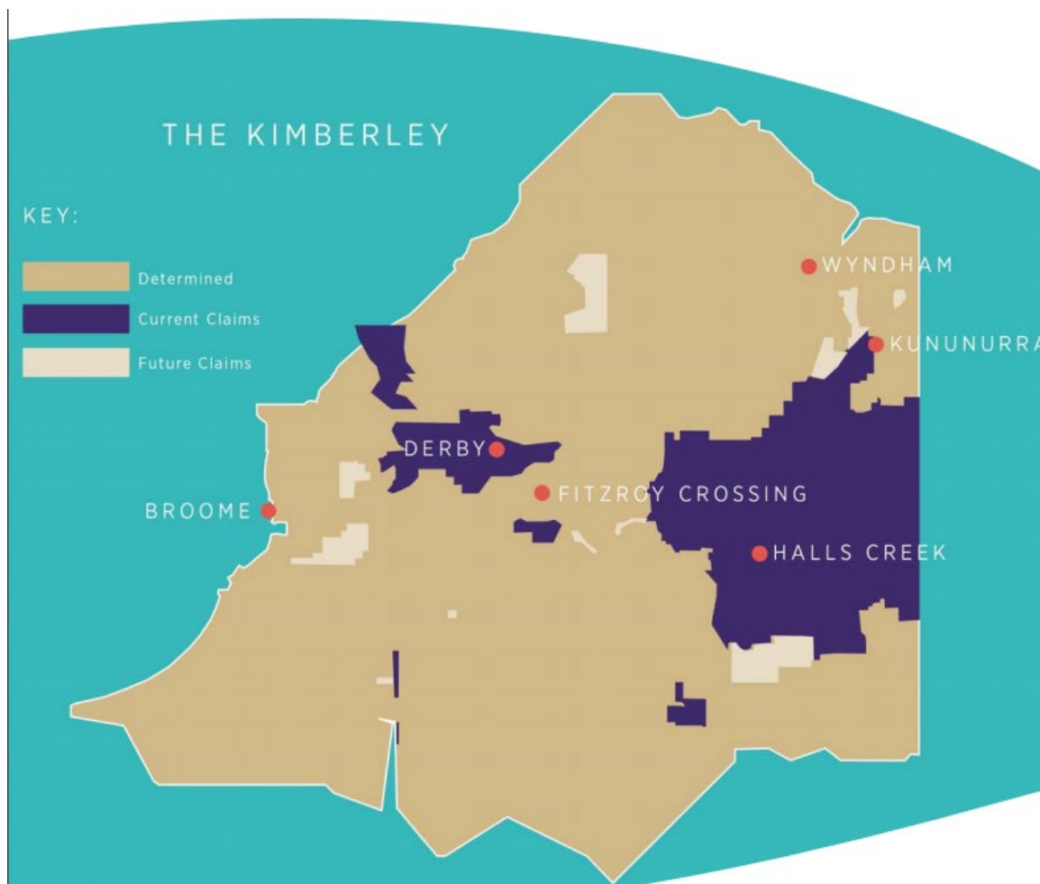
Figure 1 | Kimberley region NTA determinations as at 30 June 2018 9